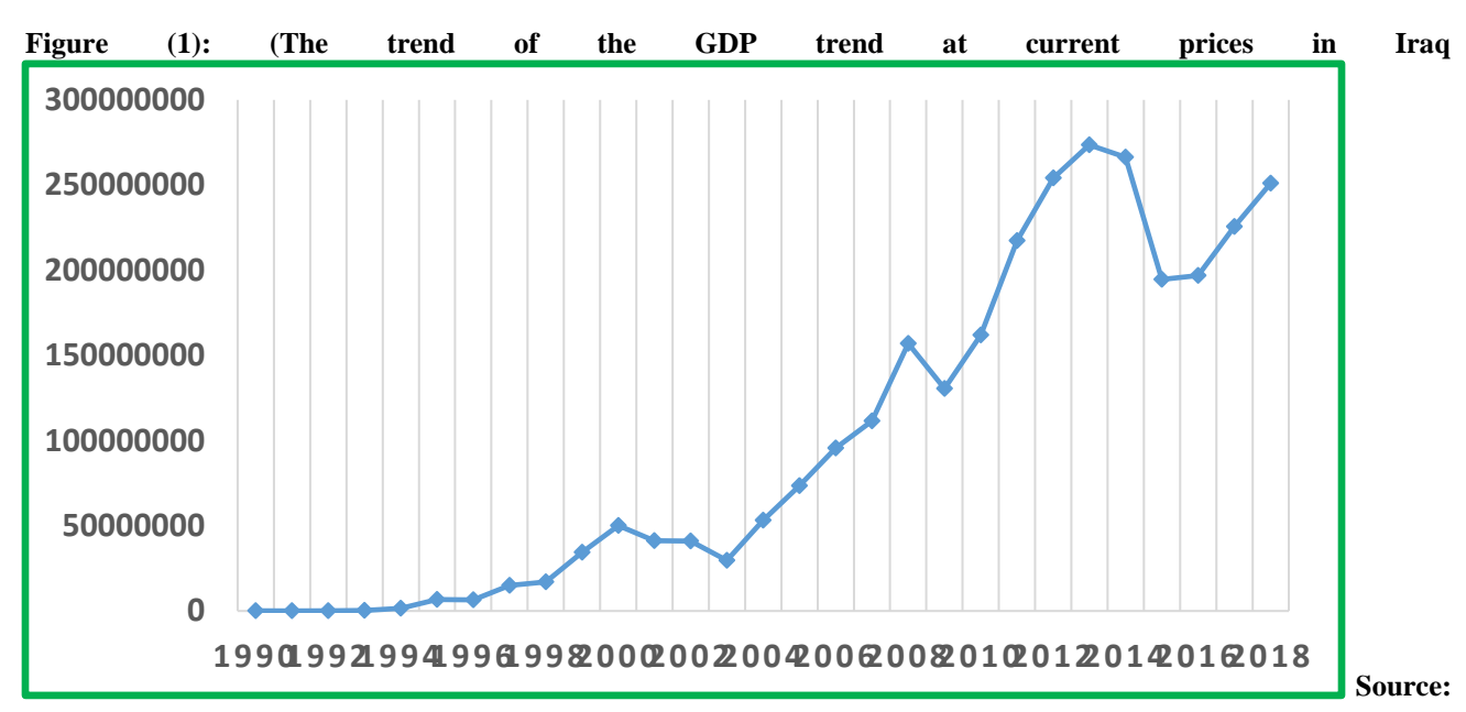
Figure 1 prepared by the researcher based on the data of Table (1).

(IJRSSH) 2020, Vol. No. 10, Issue No. IV, Oct-Dec