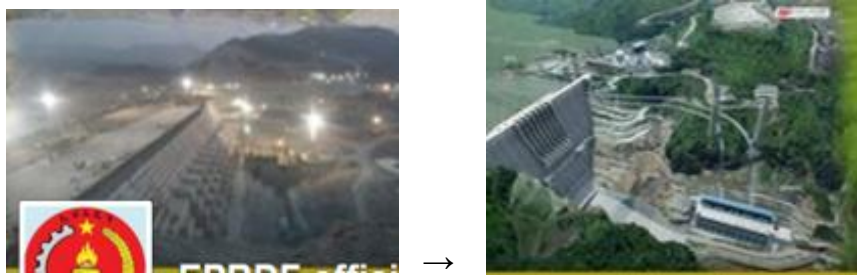
Fig.3 the Facebook walls of EPRDF

It may be hard to grasp the implied meaning of each picture standing alone just without having pictures arranged in a meaningful sequence one after the other. If each picture is singled out and deconstructed, it would have different meaning. But when it comes in a series, then the meaning of one affects the meaning of the other. To put it more precisely, the first picture on the left determines the meaning of the third picture from the left which would in turn support the efficient and far sighted predication which the party attributes to itself.