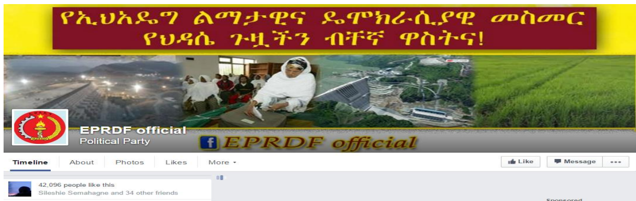
Fig.2 the Facebook Wall of EPRDS

Visually, EPRDF also did try to attribute itself as a far-sighted and efficient party committed to bring development in the country. The following background profile pictures have been selected from the Facebook page of EPRDF to visually illustrate and support the party's positive predication of self. In this picture, by making use of an implicit symbolic meaning, the party tried to depict itself positively as a capable, efficient and far-sighted political party.