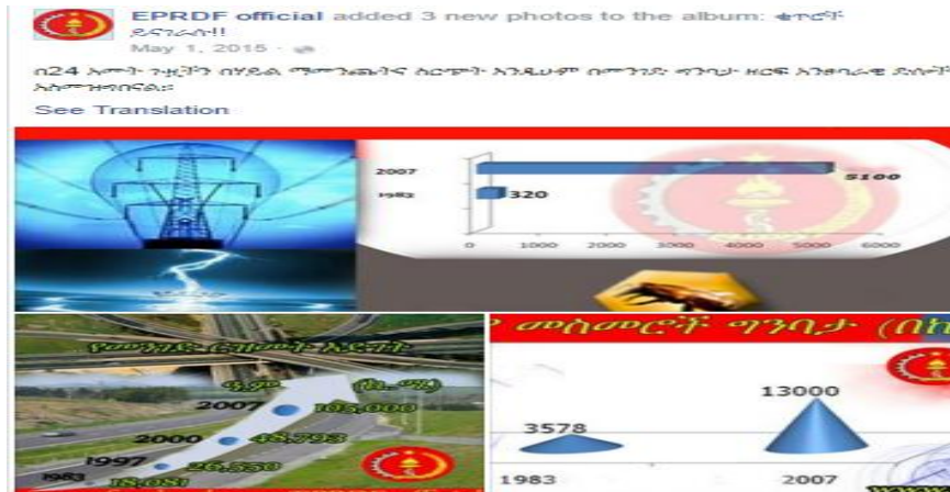
Fig1. The Facebook page postings of EPRDS

party used topos of history and topos of number as argumentation strategies to describe itself as a successful party.