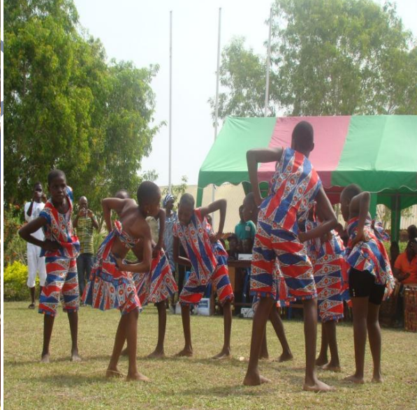
Figure 4: A traditional dance by the Actors