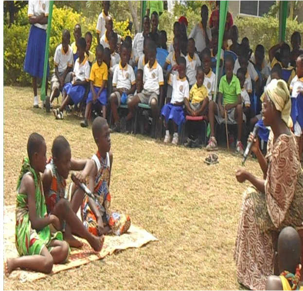
Figure 2: the Writers Guild meeting