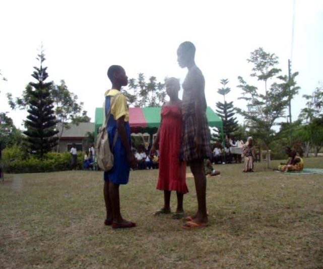
Figure 1: A scene from the performance

the elderly. Due to this attitude she lost a life time opportunity in the form of scholarship to another pupil. Figures 1, 3 and 4 are scenes from the final performance of the dramatic piece created by the children.