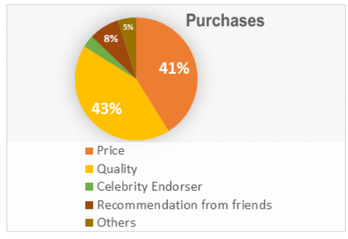
Figure 1: Purchase Decision

Though the research was supposed to collect 100 responses in total, but could easily gather 124 responses. When the respondents were asked about which is the most important factor they consider while making purchases from an online brand then following responses were obtained: